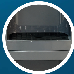
Removable drip tray