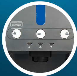
Hot, Cold and Ambient water faucet